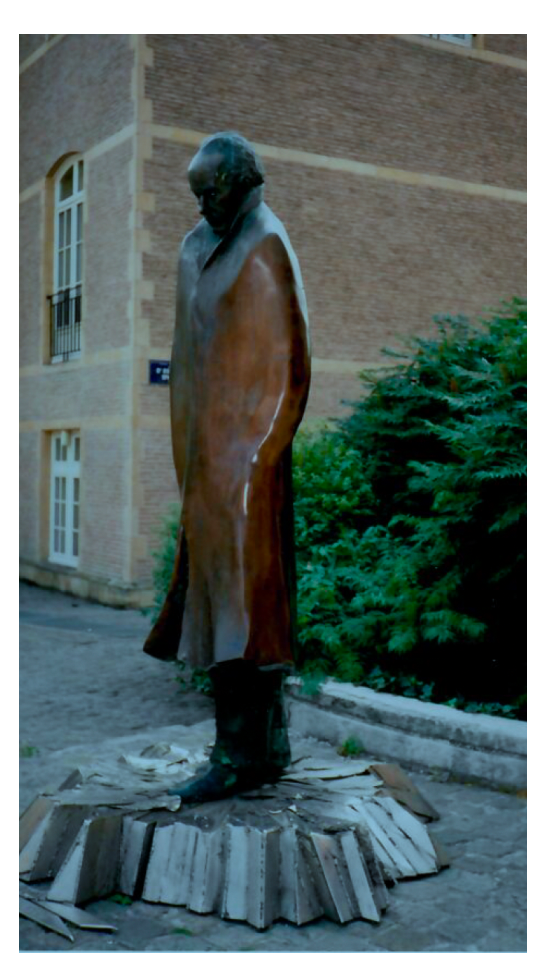
Statue of Bartók, designed by Imre Varga, at the Spanjeplein/Place d'Espagne (Brussels)