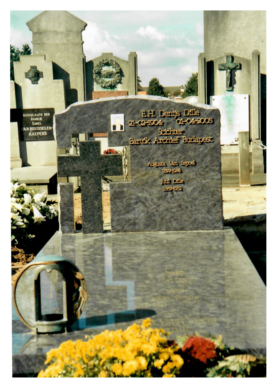
Gravestone of Denijs Dille in the cemetery of Aarschot (Belgium)