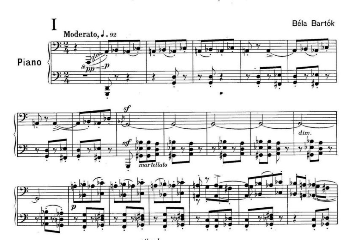
Opening bars of the Dance Suite, arranged for piano by Bartók © 1952 by Boosey and Hawkes Music Publishers Ltd.

frequently performed compositions. (...) It is a beautiful work that is impressive when lead by a conductor who understands the nature of folk music"